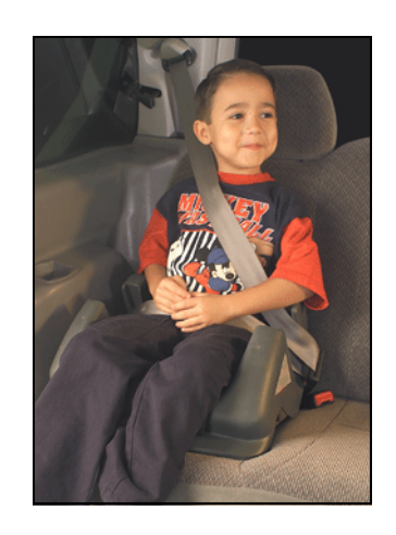
3) A child over four years, but under eight years who is less than 57 inches and under 80 pounds shall be secured in a booster type seat or another child passenger restraint system secured by a belt system.