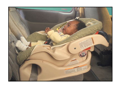
SB 72 Child Safety Seats and Seat Belts