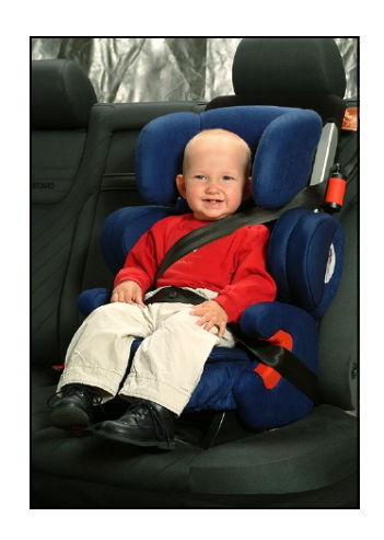
2) A child one to four years of age who is over 20 pounds shall be properly secured in a child restraint device.