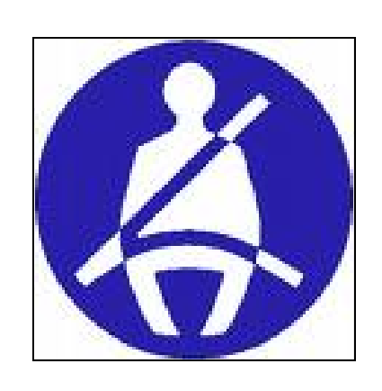
5) A child between the ages of eight and sixteen who does not meet the height and weight requirements of 3) shall be secured in a child safety device or a seat belt, whichever is appropriate.