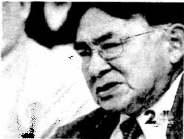
North Slope Borough Mayor Ed Itta

The U.S. uses 10,000 gallons of oil a second every day and Shell Oil in the United States, which sponsored the summit, made that point very clear.