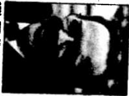
SEN. TED STEVENS

U.S. coastal waters are divided into three zones: from zero to three miles is state waters; in federal waters from three