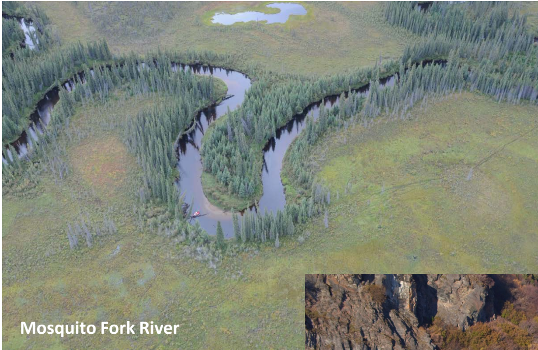
Mosquito Fork River