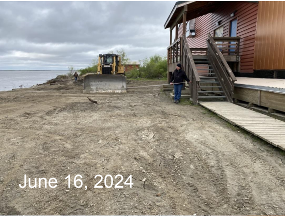
June 16, 2024

Forward funded with existing project funds in hopes that extra funds will be available through the FY26 CIP application process.