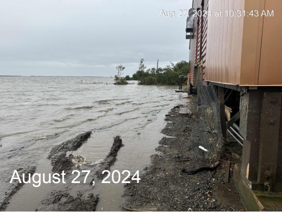
Aug 27, 2024 at 10:31:43 AM