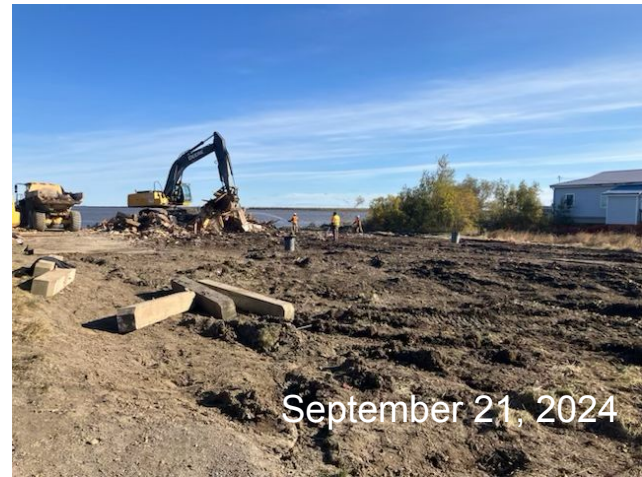
September 21, 2024