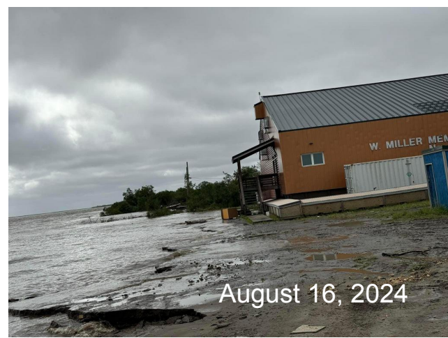
August 16, 2024