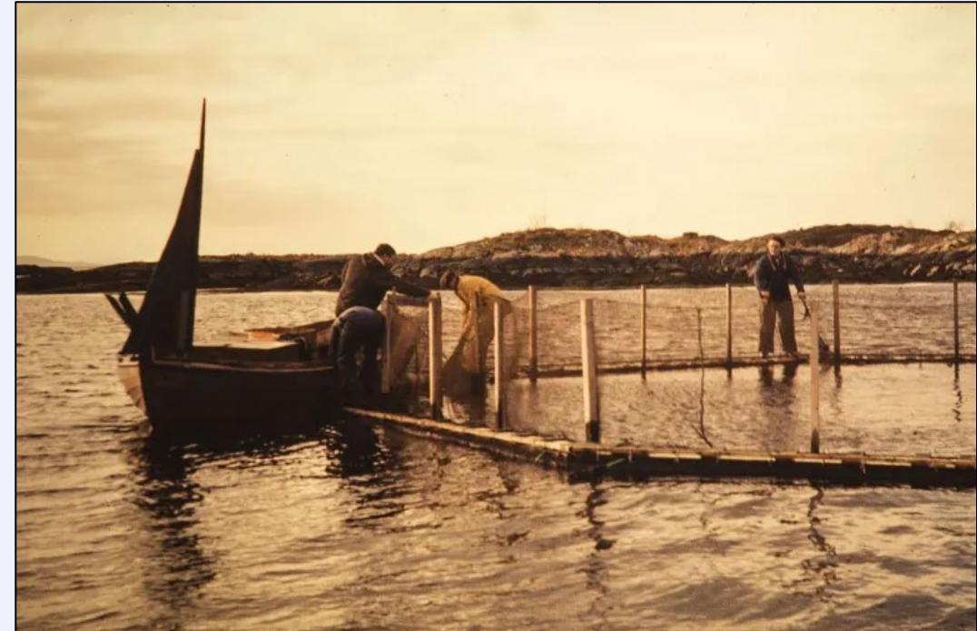
A pioneering Norwegian fish farm in 1972

In 1990, the Alaska Legislature preemptively passed a ban on commercial salmon and other finfish farming under AS 16.40.210.