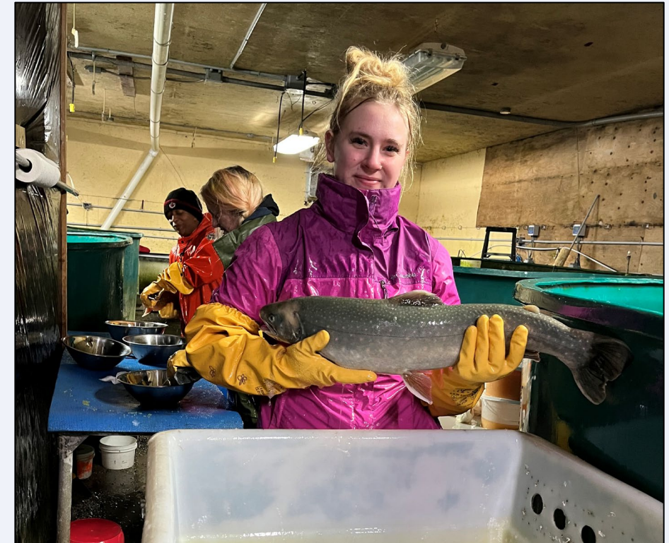
Icy Waters Arctic Charr Fish Farm in Whitehorse.

Economic Growth : introduces a new industry to Alaska, creating jobs and diversifying our economy.