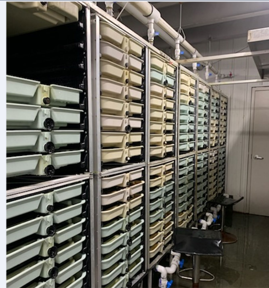
Icy Waters Arctic Charr Fish Farm in Whitehorse.