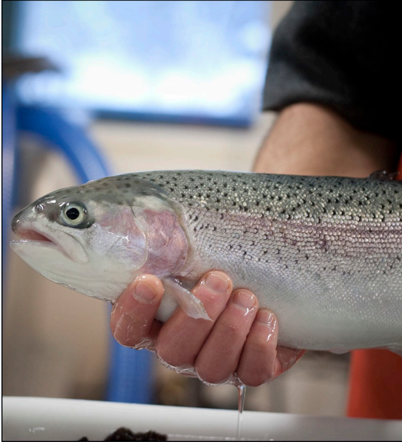
ADF&G Division of Sport Fish William Jack Hernandez Hatchery