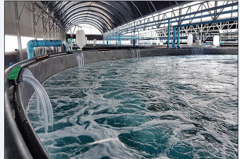
Indoor fish farm facility.